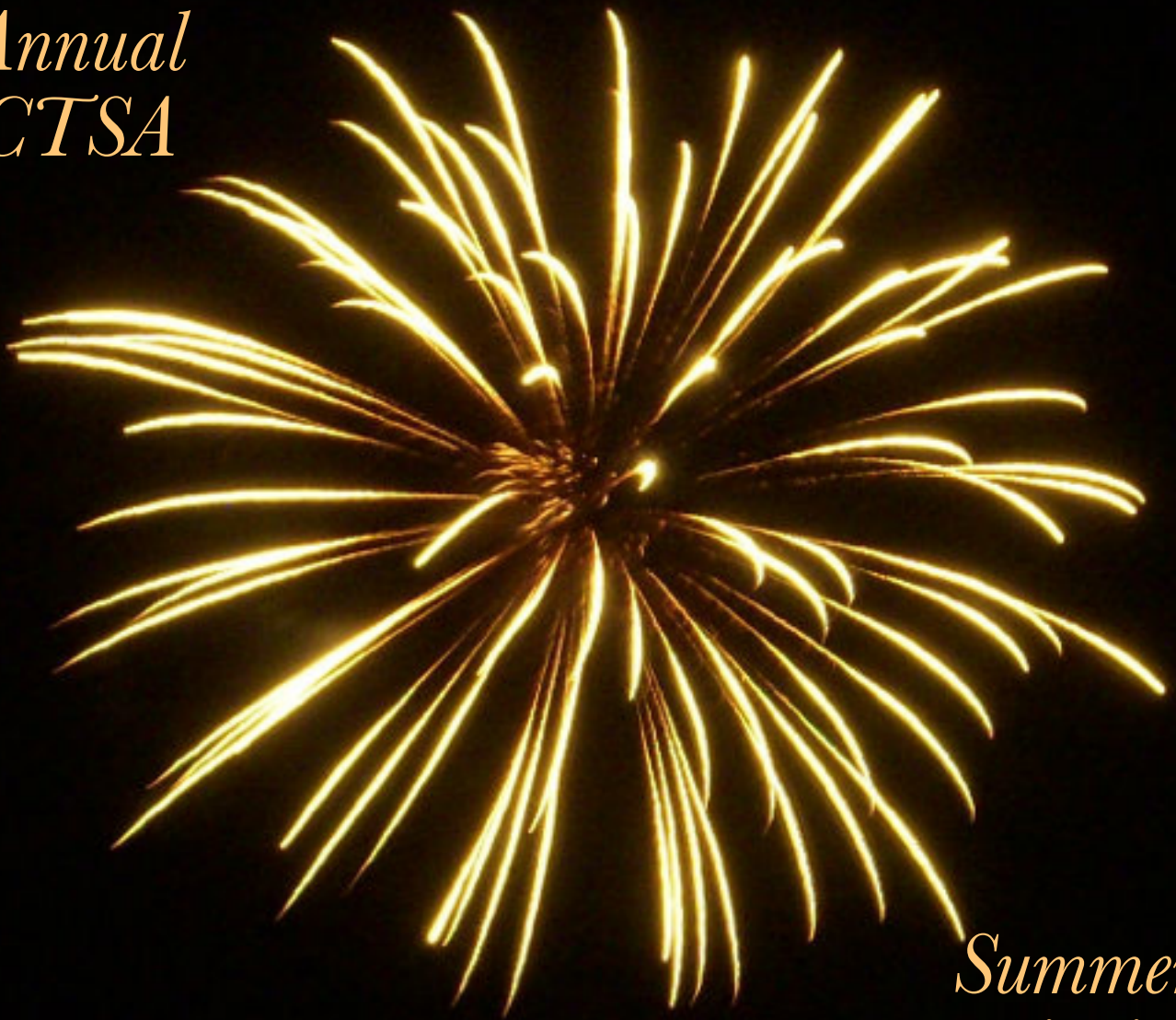
4 July 2011 Fireworks