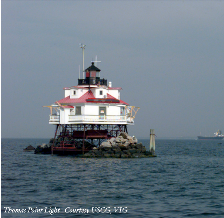
Thomas Point Light

Three Lights Fiasco Saturday 13 July 11 am Start